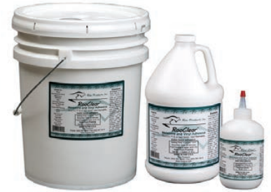
↑ Melamine Glues, pages R-9 - R-10