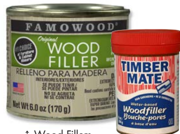
↑ Wood Fillers pages R-57 - R-59