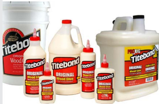
↑ Yellow Wood Glues, pages R-2 - R-3