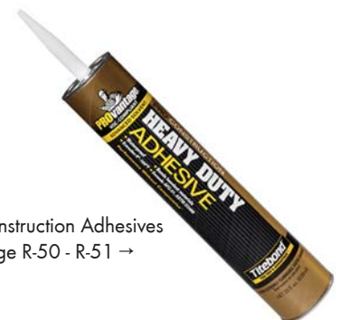
Construction Adhesives page R-50 - R-51 →

Note: Some of the items in this section are not available in all markets. Please contact your Würth Baer Supply representative for more information.