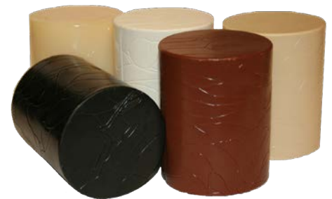
↑ Edgbanding Adhesives pages R-43 - R-49