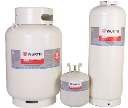
Canister Contact Adhesives ↑ pages R-30 - R-37