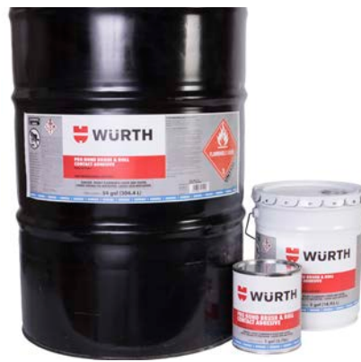
↑ Bulk Contact Adhesives pages R-21 - R-29