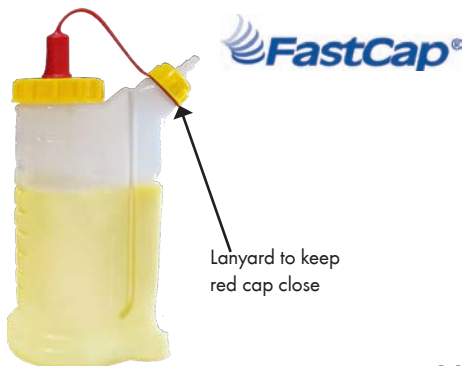
Lanyard to keep red cap close